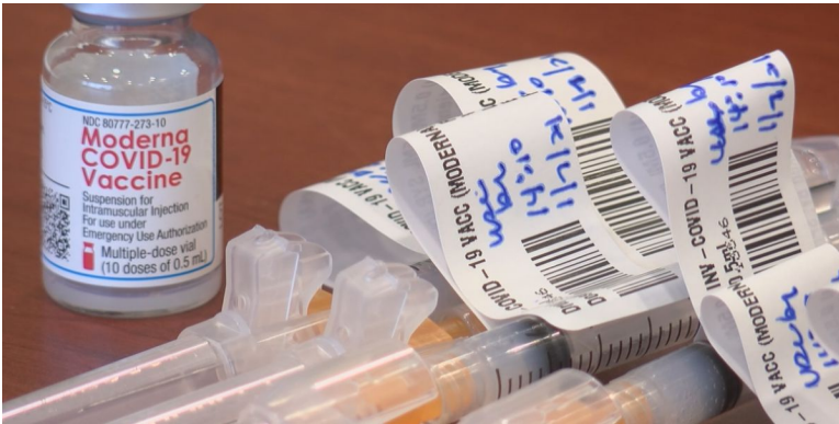
As Virginia struggles to boost vaccination rates,... by Kate Masters January 21, 2021